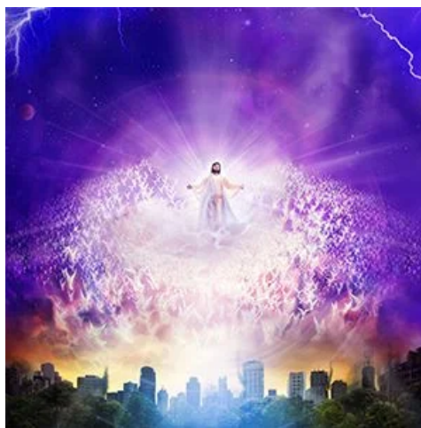
Second coming in the clouds at the beginning of the 1,000 years to take His people to heaven.