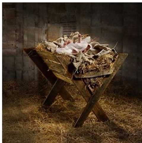
First coming to Bethlehem in a manger.