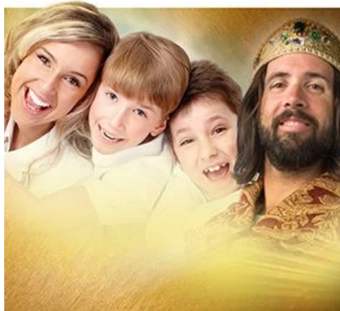
The righteous will be in heaven with Jesus during the 1,000 years.

“The slain of the Lord shall be from one end of the earth even to the other end of the earth. They shall not be lamented, or gathered, or buried; they shall become refuse on the ground” (Jeremiah 25:33). “I beheld, and indeed there was no man” (Jeremiah 4:25).