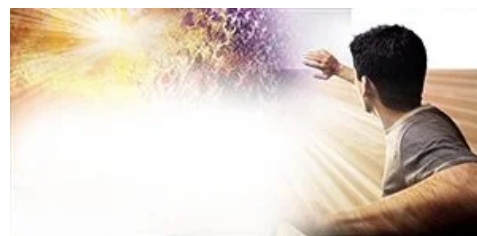
The living wicked will be slain by the brightness of Jesus’ second coming.

When the brightness of all the angels, God the Father, and God the Son combine, the unsaved will die as if hit by lightning. The wicked already dead when Jesus returns will remain in their graves until the end of the 1,000 years.