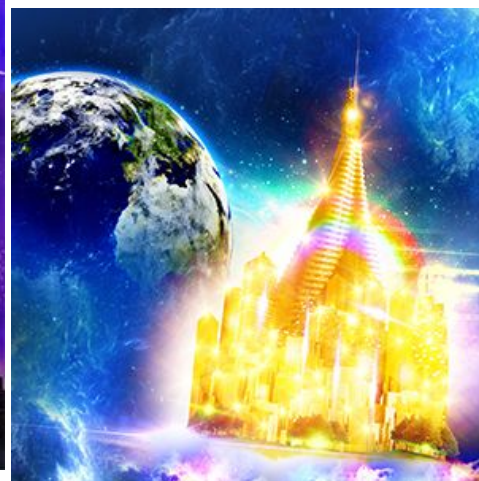
Third coming with the holy city and all righteous people at the close of the 1,000 years.