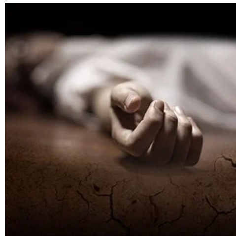
The wicked will lay dead upon the earth during the 1,000 years.

not be a person alive on the earth. The righteous will all be in heaven. All the wicked will be laying dead upon the earth. Revelation 22:11, 12 makes it clear that the case of every person is closed before Jesus returns. Those who wait to accept Christ until the 1,000 years begin will have waited too long.