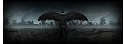
The earth, in a torn-up, darkened condition, is the “bottomless pit” where Satan will be forced to stay during the 1,000 years.

confined with a literal chain. Satan is “tied down” because he has no people to deceive. The unsaved are all dead and the saved are all in heaven. The Lord confines the devil to this earth so he cannot roam the universe hoping to find someone to deceive. Forcing the devil to stay on the earth, alone with his demons for a thousand years with no one to deceive, will be for him the most galling chain ever forged.