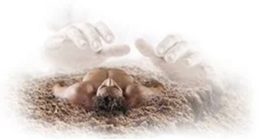
Adam was created by God in the beginning.

Answer: God made us from dust in the beginning.