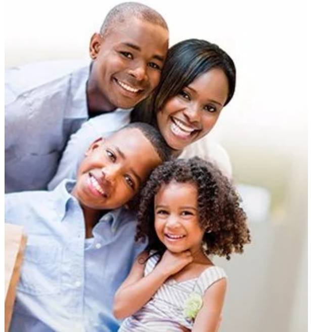
These four people are four souls.