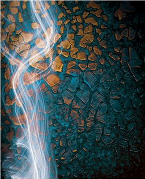
Body(Dust) - Breath(Spirit) = Death (No Soul)

Answer: According to God's Word, souls do die! We are souls, and souls die. Man is mortal (Job 4:17).