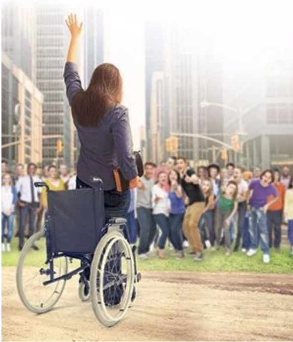
All miracle working is not from God, because devils also work miracles.

“For they are the spirits of devils, working miracles” (Revelation 16:14, KJV).