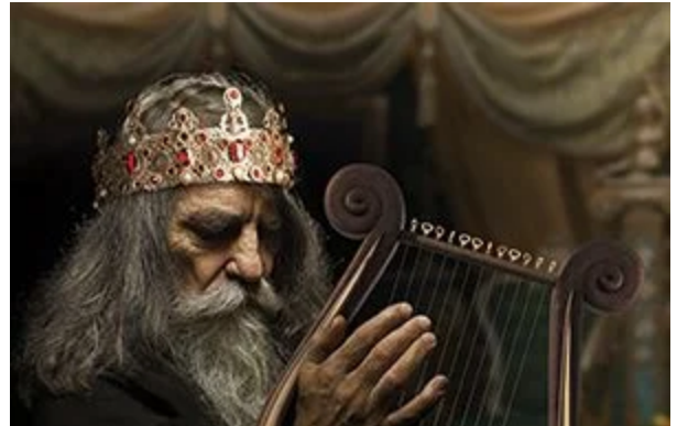
The Bible suggests that King David will be in God's kingdom, but that he is in his grave now, where he awaits the resurrection.