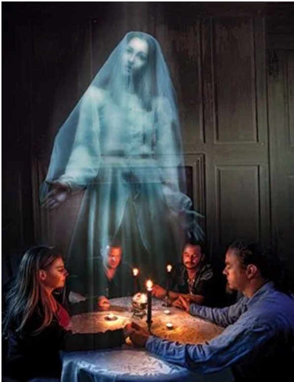
Though millions think it is possible, the dead cannot communicate with the living.

9. Jesus called the unconscious state of the dead “sleep” in John 11:11–14. How long will they sleep?