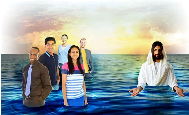
If Jesus is speaking to you about baptism, do not put it off.