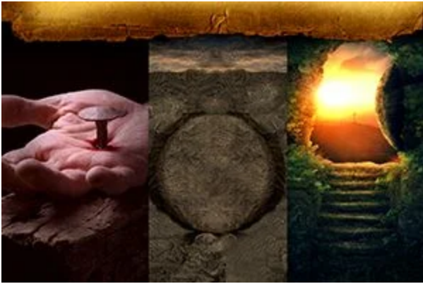
When I am baptized, I affirm my belief in Jesus' death, burial, and resurrection.

resurrection, knowing this, that our old man was crucified with Him, that the body of sin might be done away with, that we should no longer be slaves of sin” (Romans 6:4–6).