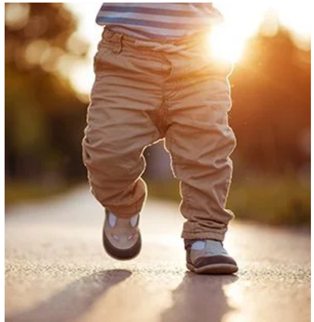
New Christians are like toddlers learning to walk. They sometimes slip and fall.

Answer: This is like saying a baby should never try to walk until certain she will never slip and fall.