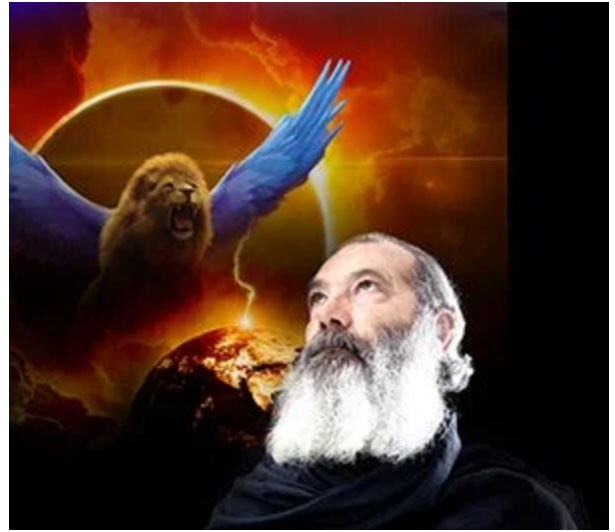
The angel told Daniel that the prophecies of this book would be sealed until 1798, the time of the end.

Answer: In Daniel 12:4, the prophet was told to seal the book till the "time of the end." In verse 6 an angelic voice asked, "How long shall the fulfillment of these wonders be?" Verse 7 says, "It shall be for a time, times, and half a time." The angel assured Daniel that the section of the book dealing with end-time prophecies would be opened after the end of the 1,260-year period of papal control, which was, as we learned earlier in this Study Guide, 1798. So the time of the end began in the year 1798. As we have seen, the book of Daniel contains crucial messages from heaven for us today. We must understand it.