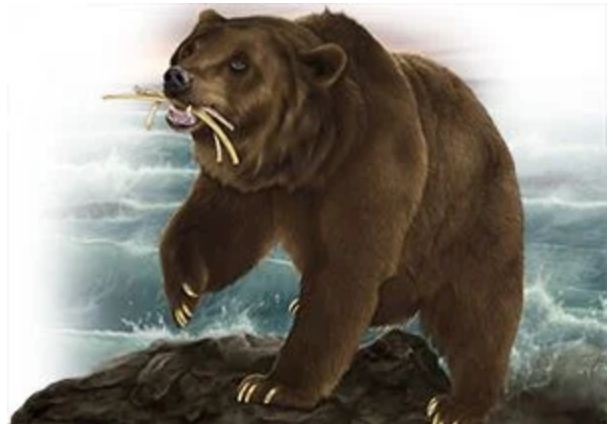
The bear with three ribs in its mouth symbolizes Medo-Persia.

3. What kingdom does the bear represent (Daniel 7:5)? What do the three ribs in its mouth symbolize?