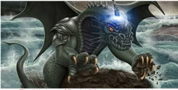
The little horn of Daniel 7:8 represents Antichrist.

“I was considering the horns, and there was another horn, a little one, coming up among them, before whom three of the first horns were plucked out by the roots. And there, in this horn, were eyes like the eyes of a man, and a mouth speaking pompous words” (Daniel 7:8).