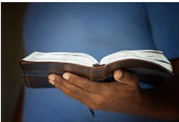
All religious teachings must be compared with Scripture to determine their accuracy.

Answer: In Daniel 12:4, the prophet was told to seal the book till the "time of the end." In verse 6 an angelic voice asked, "How long shall the fulfillment of these wonders be?" Verse 7 says, "It shall be for a time, times, and half a time." The angel assured Daniel that the section of the book dealing with end-time prophecies would be opened after the end of the 1,260-year period of papal control, which was, as we learned earlier in this Study Guide, 1798. So the time of the end began in the year 1798. As we have seen, the book of Daniel contains crucial messages from heaven for us today. We must understand it.