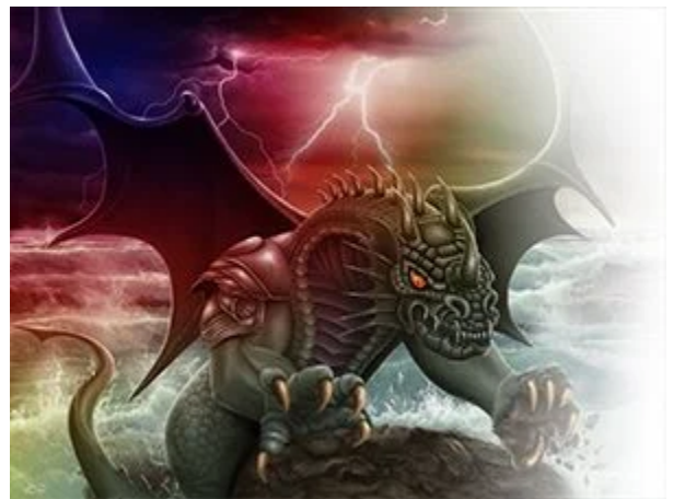
The world empire of Rome is symbolized by the monster beast of Daniel chapter 7.

5. The Roman Empire, the fourth kingdom, is represented by a powerful monster with iron teeth and 10 horns (Daniel 7:7). What do the horns represent?