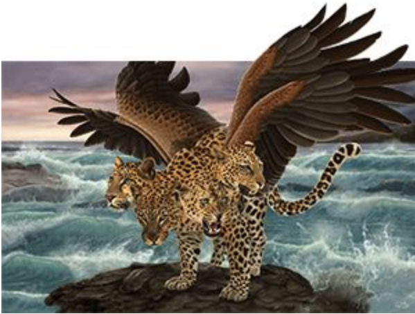
The leopard beast of Daniel 7 represents the world kingdom of Greece.

became stronger (represented in Daniel 8:3 by the ram's second horn that grew "higher"). The three ribs represent the three principal powers conquered by Medo-Persia: Lydia, Babylon, and Egypt.