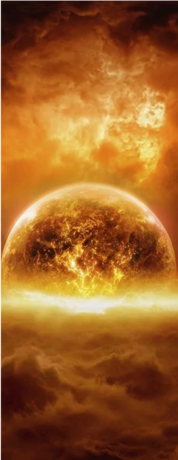
Sin and sinners will be eradicated by fire from God.