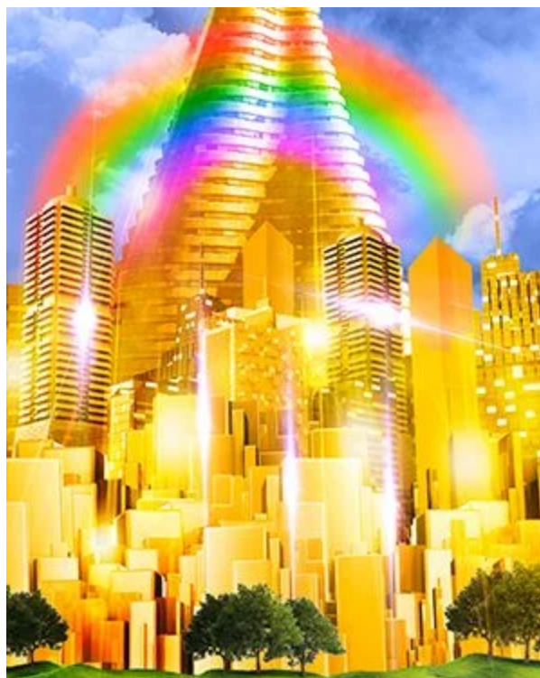
God is the architect and builder of the holy city.

Answer: The Bible says that God is building an awesome and huge city for His people—and it's as real as any other city in the world!