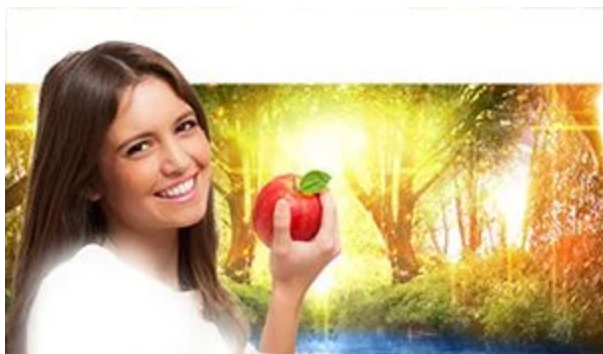
Heaven's fantastic tree of life brings unending life and youth to all who eat of it.

“The Holy City ... prepared as a bride beautifully dressed for her husband ... shone with the glory of God, and its brilliance was like that of a very precious jewel, like a jasper, clear as crystal. ... The city was laid out like a square, as long as it was wide” (Revelation 21:2, 11, 16 NIV). The city, with all of its precious stones, gold, and shimmering beauty, will be lighted with the glory of God. Its breathtaking majesty and purity is compared to “a bride beautifully dressed for her husband.”